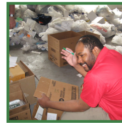
Clients from RMHA donate their time to the AFYA Foundation, at right.